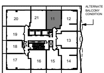
BLDG. A - FLOORS 11-25

Any stated areas if shown are approximate only and subject to normal construction variances. Actual useable floor space may vary from any stated or depicted floor area and the suite/unit shall be measured in accordance with the provisions set out in the Directive – Floor Area Calculations published by the HCRA. The layout of the suite/unit may be reversed depending on the location of the unit within the project. Any furniture, if any, depicted is for illustration purposes only and does not necessarily reflect the fixtures, finishes, appliances and/or electrical plan of the suite/unit and is not included in the purchase price. Ceiling heights are subject to bulkheads, exposed ducts, dropped ceilings and structural beams, as applicable, pursuant to plans. The view from or through the windows to the exterior cladding of the building may be partially obstructed by materials affixed to the exterior cladding of the building as part of the architectural design elements and/or interior structural columns that may be required pursuant to the recommendation of the project's engineers. The size, location and/or configuration of any windows and glass shown may be changed, varied or mirrored. Any and all materials, measurements, dimensions and/or specifications are subject to change without notice. All illustrations are artist's concept only. E. & O. E. May 1, 2022.