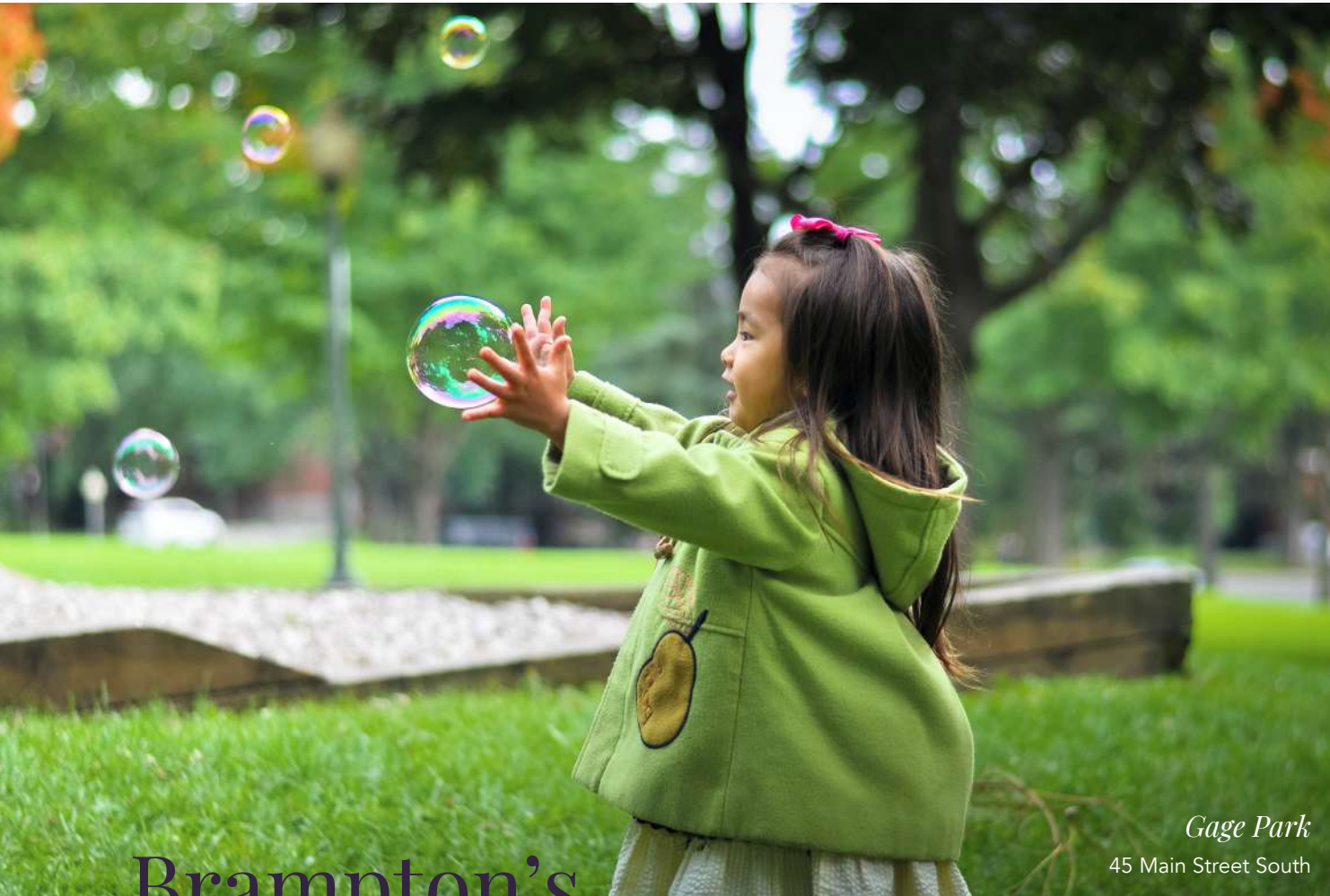
Gage Park 45 Main Street South